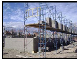
Project site during construction

This facility will hold 24% of the population and 100% of Ralls High School and Middle School students."