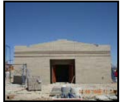
Storm Shelter during construction

Several years ago a tornado impacted several facilities in the Ralls area causing extensive damage to numerous buildings. The above-ground shelter design was selected based on research done at Texas Tech University as well as the Federal Emergency Management Agency (FEMA).