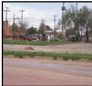
Project site before construction

School and Middle School students. The storm shelter was constructed in the center of town with easy access for schools, businesses and city offices. Aside from physically protecting citizens during an emergency, this facility will also be the lifeline for the community should any disaster occur. The City of Ralls storm shelter has